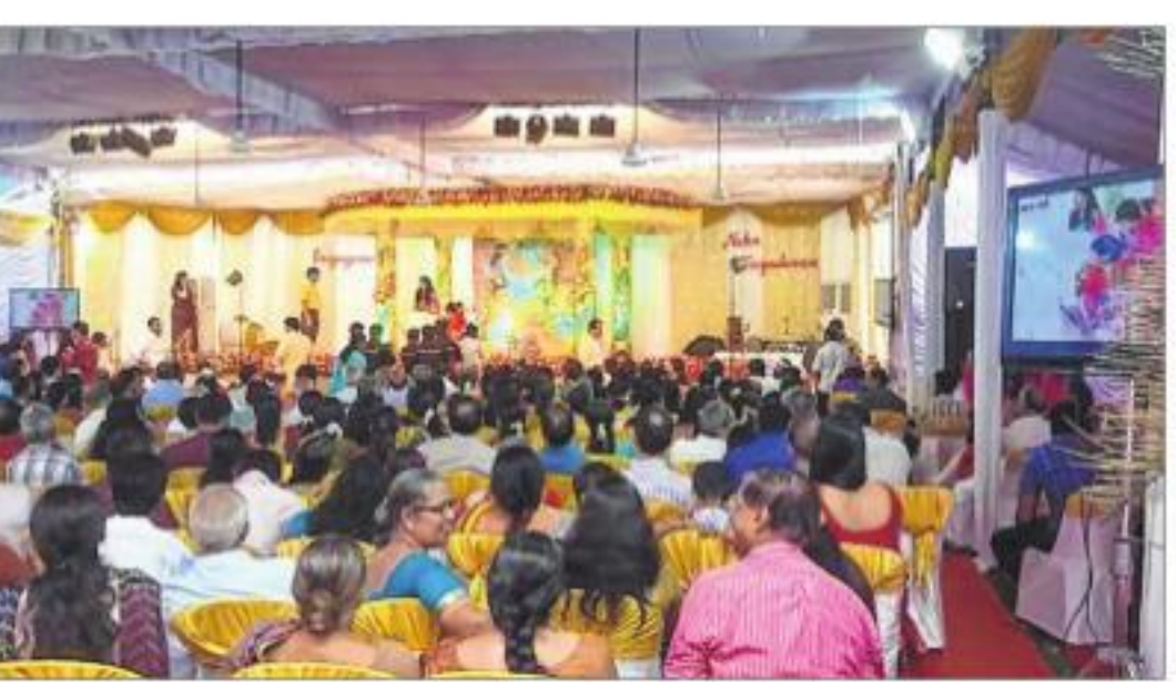
महापरिनिर्वाणदिनी दोन डोस घेतलेल्यांना परवानगी