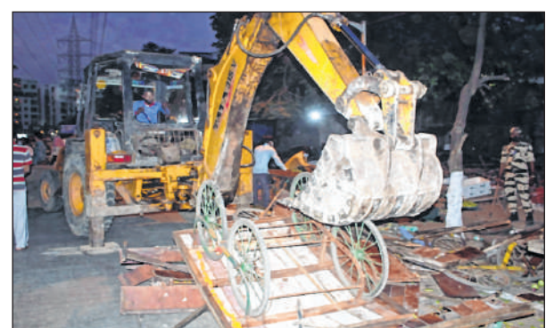
The civic body uses JCB to crush stalls, handcarts of illegal hawkers